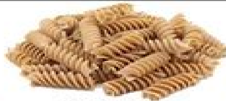
WHOLE WHEAT PASTA