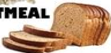
WHOLE WHEAT BREAD