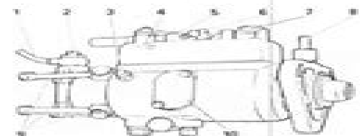
Fig. 13—On models equipped with C.A.V.-D.P.A. pump, loosen bleed screws 2, 3 and 4 in that order to bleed air from pump. Refer to text.