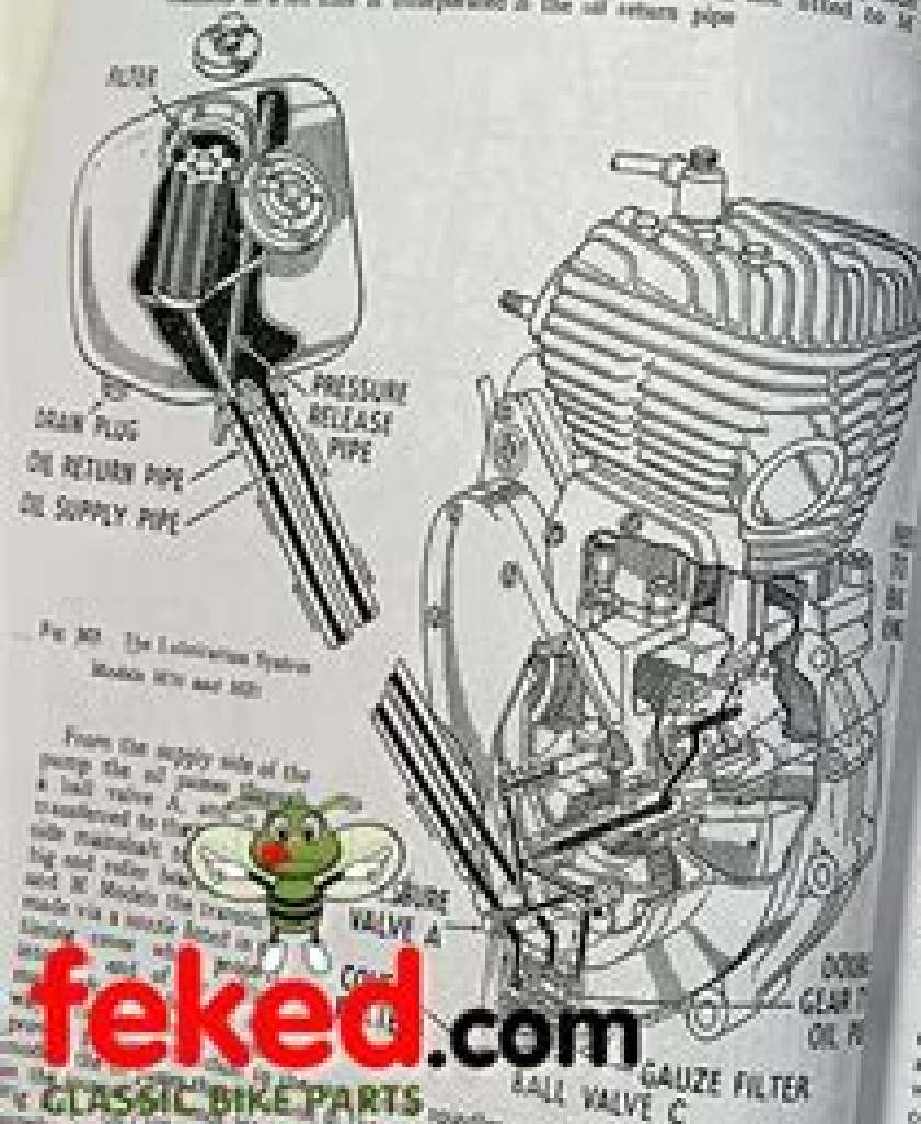
Fig. 302 The Lubrication System Models 1154 and 1155

The engine lubrication system is of the dry sump type operated by a double pump, situated in the bottom of the crankcase on the right-hand side. The pump draws the supply and return pipes to the tank and the rocker feed and drain pipes in the B Group. The oil drawn from the oil tank to the supply side of the pump first passes through a coarse mesh filter. This filter is not fitted to M Group machines as a jet filter is incorporated in the oil return pipe.