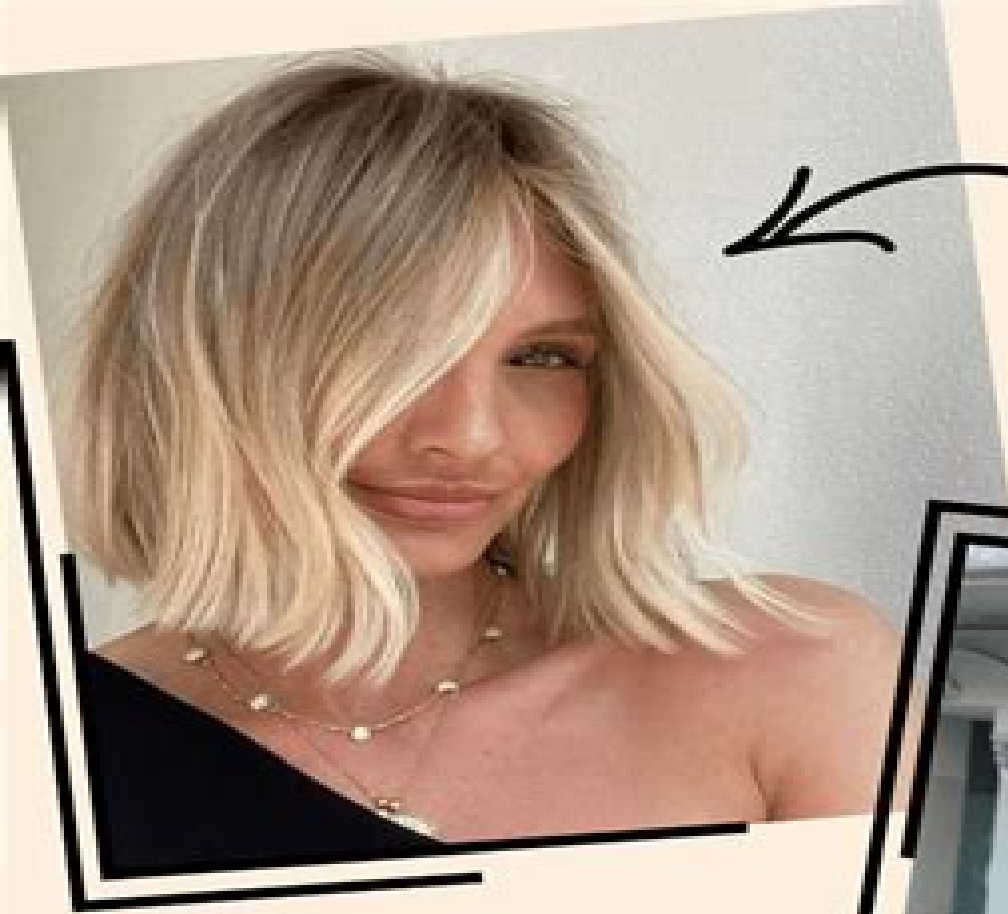
Bright blonde balayage with bold money pieces