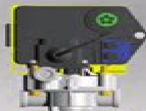
2-Port ABS Relay Valve