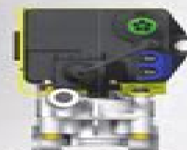
6-Port ABS Relay Valve

2S/1M - 4S/2M PLC Select Anti-Lock Braking Systems