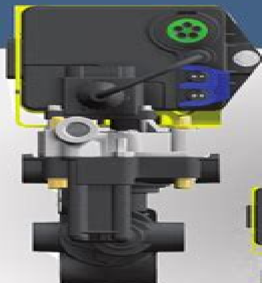
PLC Select 1M -FFABS