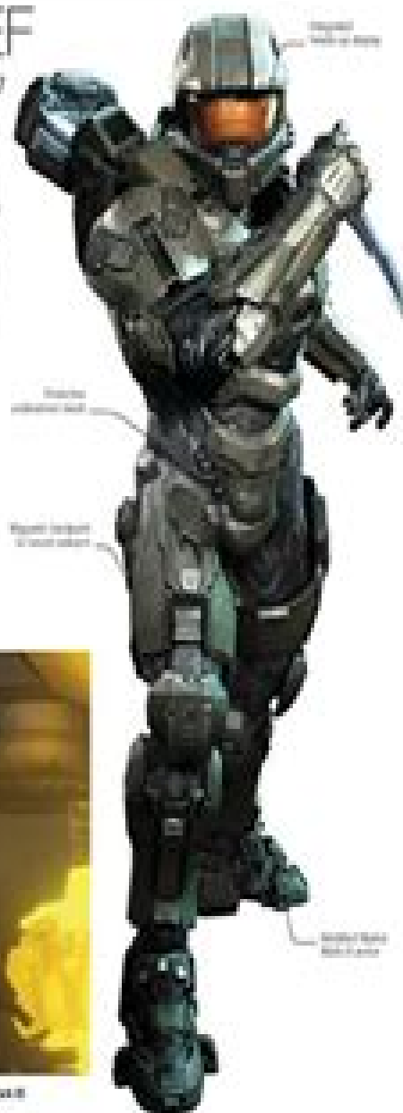
Master Chief's armor is made of Kevlar Kevlar II.