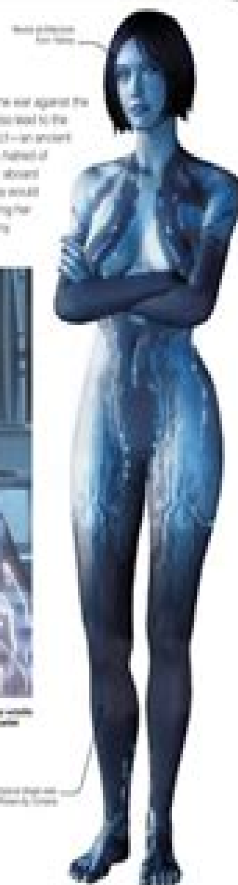
Cortana's unique AI construct, a complex system of neural pathways that evolved after three years of service.