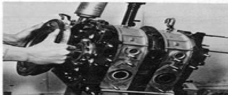
Fig. 1-76 Installing flywheel