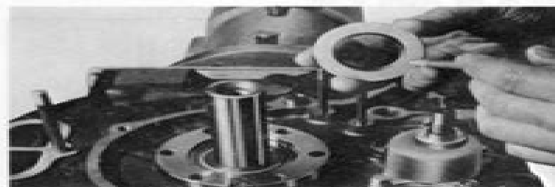
Fig. 1-78 Fitting thrust plate