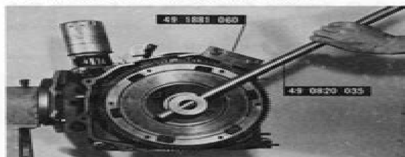
Fig. 1-77 Tightening flywheel nut