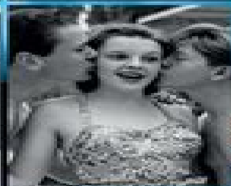
Judy Garland (with Martin Luther King Jr. & Martin Luther King Jr.)