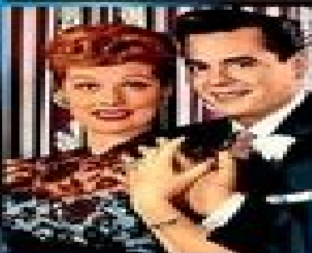
Lucille Ball & Desi Arnaz

A TRIBUTE TO THE GLORY DAYS OF ENTERTAINMENT & THE WAY WE WERE