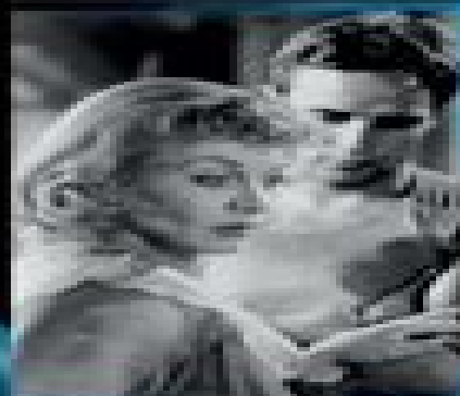
Marlon Brando & Marilyn Monroe