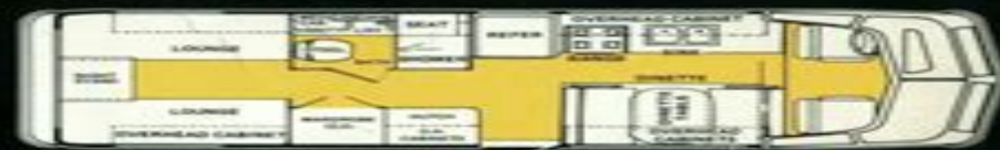
Royale Side Bath