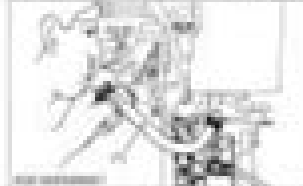
Fig. 3 Valve Train