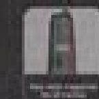
GLOCK MB Ambidextrous magazine release

After conversion of the magazine release, the magazine will not work in pistols converted with the ambidextrous magazine release.