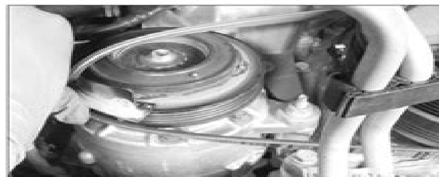
12.13 Install the belt installation tool and rotate the crankshaft pulley until the belt is lifted onto the pulley

9 Remove the engine splash shield (see Section 8).