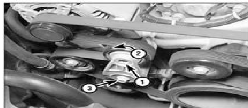
12.6a V6 engine accessory drivebelt tensioner details

8 Remove the accessory drivebelt (see Steps 5 and 6).