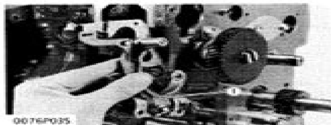
(1) Fork Lever Assembly