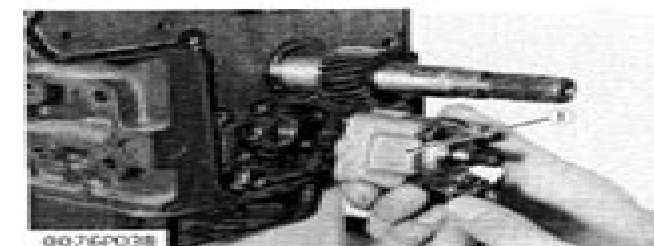
(1) Oil Pump Assembly