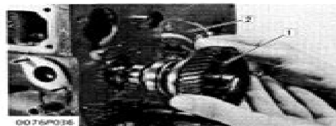
(1) Fuel Camshaft Assembly