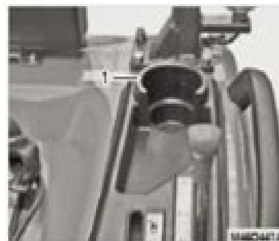
(1) Cup Holder

The cup holder is installed to the left fender for driver's convenience.