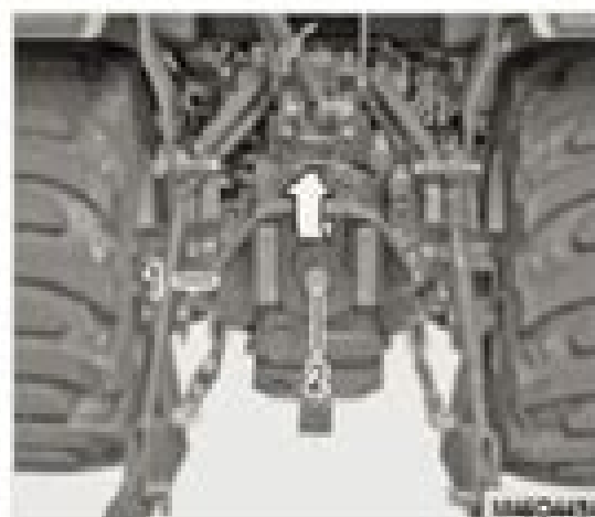
(1) PTO Shaft Cover (2) PTO Shaft Cap

Use only the double mounting full type PTO cover.