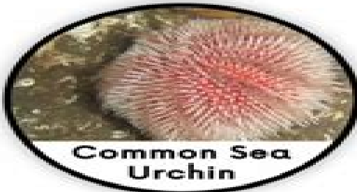
Common Sea Urchin