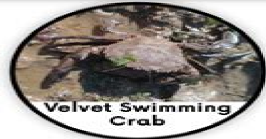
Velvet Swimming Crab