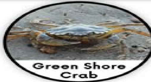
Green Shore Crab