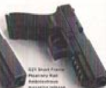
GLOCK MB Short-Frame Ambidextrous magazine release