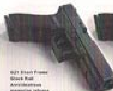
GLOCK 21 Short-Frame Ambidextrous magazine release

GLOCK MB handgun with ambidextrous magazine release. After the initial conversion of a magazine release that can be activated by either the right or left thumb of the shooting hand. The new magazine release is the ambidextrous and is made of stainless steel. It is available in black or silver. The magazine will not work in pistols not fitted with the ambidextrous magazine release.