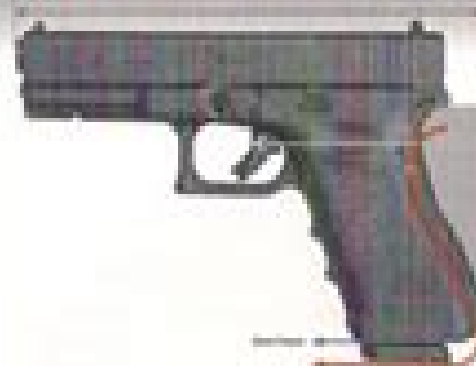
GLOCK 21SF ® Short-Frame