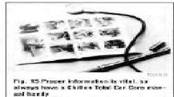
Fig. 15 Proper information is vital, so always have a Dillon Total Car Care manual handy.

The choice of a timing light should be made carefully. A light which works on the DC current supplied by the vehicle's battery is the best choice. It should have a timer tube for brightness. On any vehicle with an electronic ignition system, a timing light with an inductive pickup that clamps around the No. 1 spark plug cable is preferred.