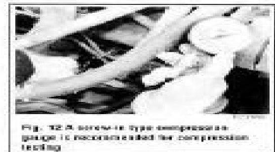
Fig. 12 A screw-in type compression gauge is recommended for compression testing.