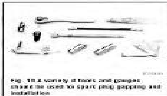
Fig. 10 A variety of tools and gauges should be used for spark plug gapping and installation.