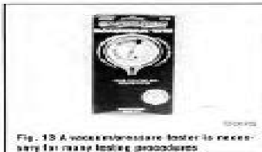
Fig. 13 A vacuum/pressure tester is necessary for many testing procedures.