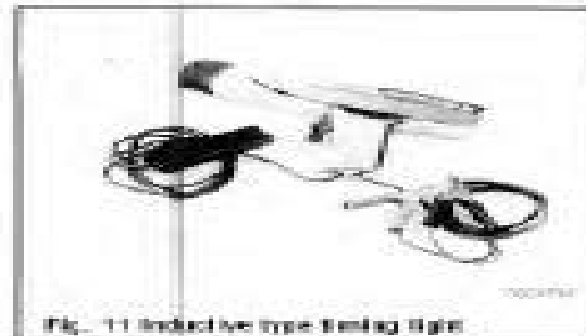
Fig. 11 Inductive type timing light