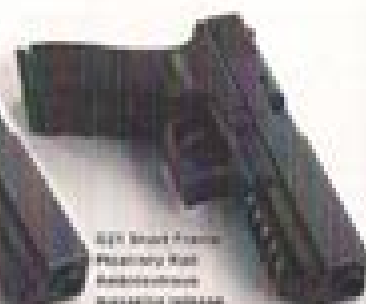
GLOCK 21 Short-Frame Ambidextrous magazine release