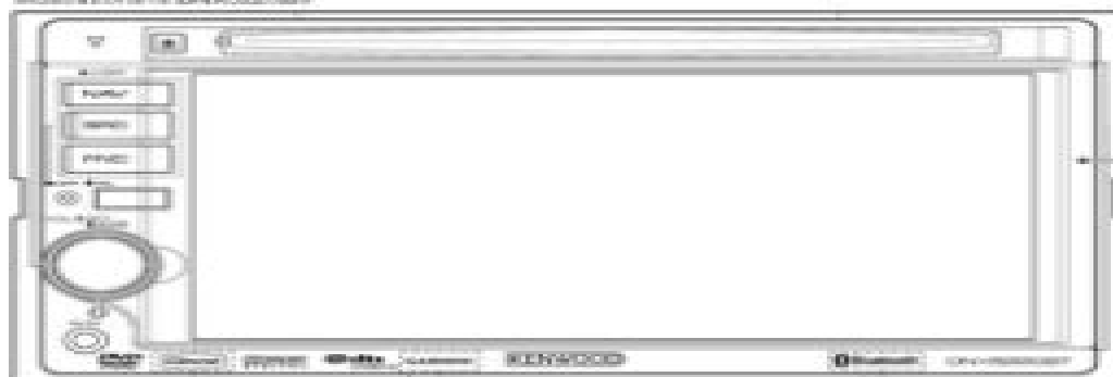
Illustration is DNX5220BT

© 2008-2 PRINTED IN JAPAN 053-8620-10 (N/S-10)