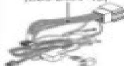
Antenna adaptor (T90-0552-05)