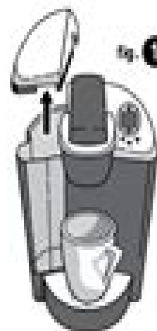
Fig. 1 Setting Up Your Brewer

NOTE: If Brewer has been exposed to temperatures below freezing, allow Brewer at least two hours to reach room temperature before brewing. A frozen or extremely cold brewer will not operate.