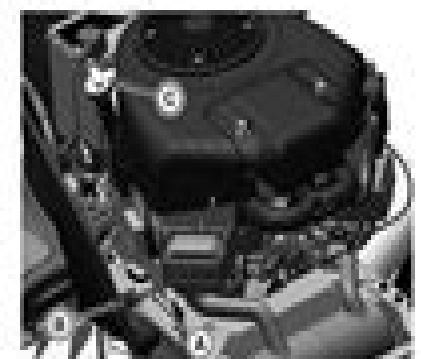
Oil drain pan is shown.