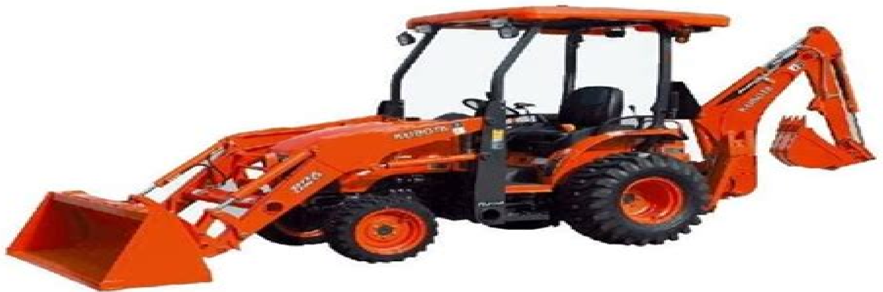
KUBOTA B26 TL500 BT820 TRACTOR FRONT LOADER BACKHOE