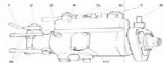
Fig. L3—On models equipped with C.A.V.-D.P.A. pump, loosen bleed screws 2, 3 and 4 in that order to bleed air from pump. Refer to text.