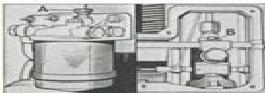
Fig. L1—On HR3 and HRW3 models, bleed screws are located at "A" on fuel filter body and "B" on fuel pump. Refer to text.

If operating temperatures fall below 10°F., an SAE 10W weight oil is recommended. In temperatures between 10° to 85°F. use SAE 20-20W and above 85°F. use SAE 30 or 10W-40.