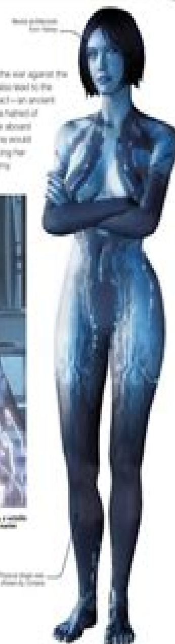
Cortana's artificial body is composed of a complex system of nanotechnology that allows her to interact with the environment.