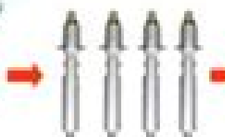
Piezo Injector Adapter