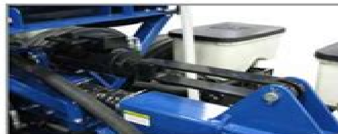
Wing lock engaged