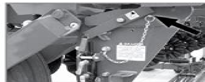
Transport latch locking pin installed