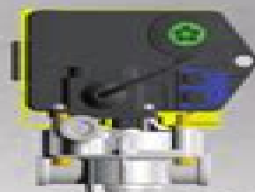
2-Port ABS Relay Valve