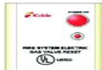
Figure 2. Manual Reset Relay, P/N 60-9101735-000

The Electric Gas Valve and Manual Reset Relay must be specifically listed for use with the Kidde WHDR or IND suppression system.