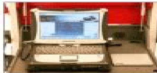
Global Diagnostic System (GDS)