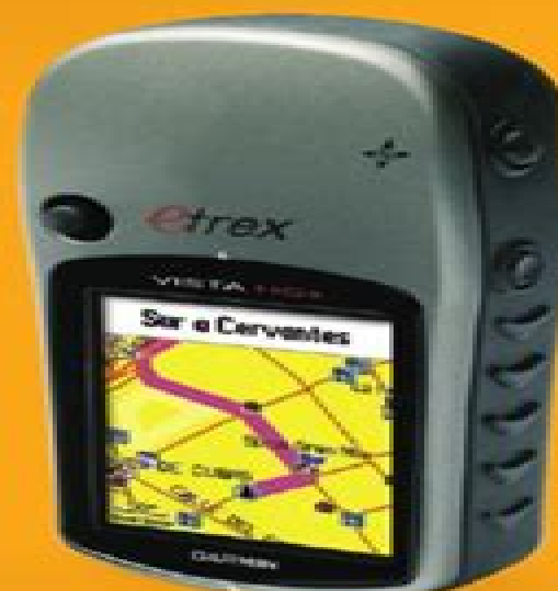
(se muestra eTrex Vista HCx)