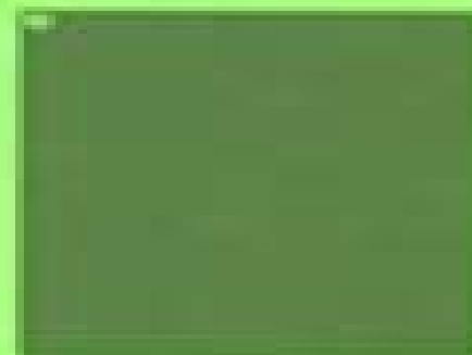
HWWT Mat for Wood Pieces