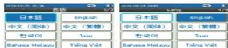
Language selection screen (left: Japanese is selected, right: English is selected)

20 Asian and European languages including Japanese, English and German are provided as standard. Display language can be easily changed by operating the buttons.