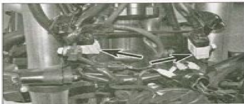
19.2b Handlebar switch wiring connectors (arrowed) - late CB