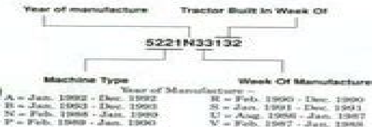
Fig. 3—The tractor serial number identifies machine type, year of manufacture, week of manufacture during specific year, and specific unit manufactured during that week. The illustration shown identifies a two-wheel-drive 360 tractor which was the 132nd tractor manufactured during the 33rd week of 1988.