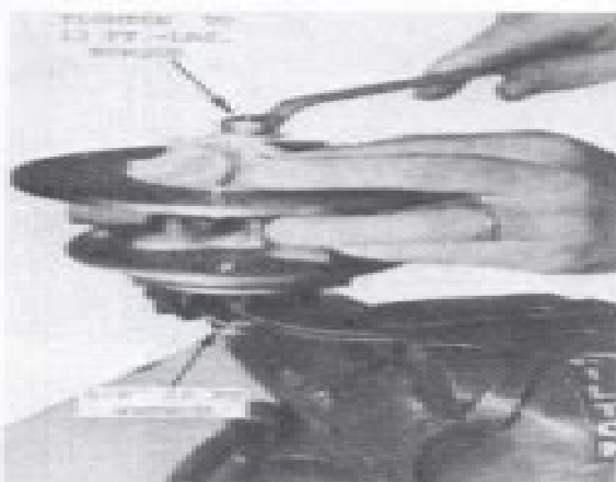
Fig. 88—A 5/8-inch 12 point wrench can be clamped in a vice to help remove and install nut as shown.

Fig. 89—The compressor insert can be carefully withdrawn using two screwdrivers as shown after snap ring is removed.