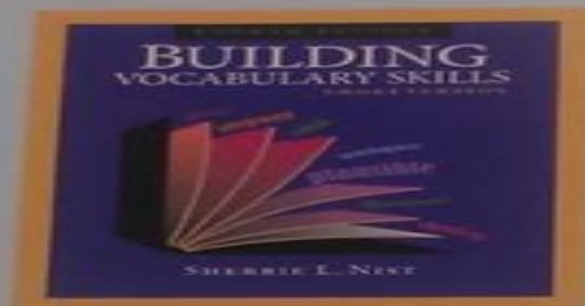
BUILDING VOCABULARY SKILLS, Short Version, 4/e Sherrie L. Nist