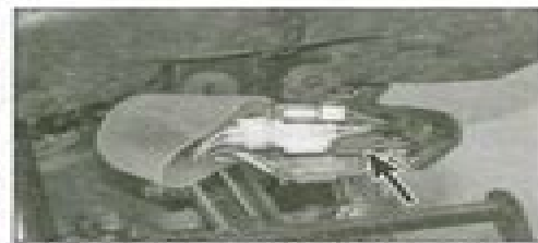
18.2b Ignition switch wiring connector (arrowed) - CBF-S/SA