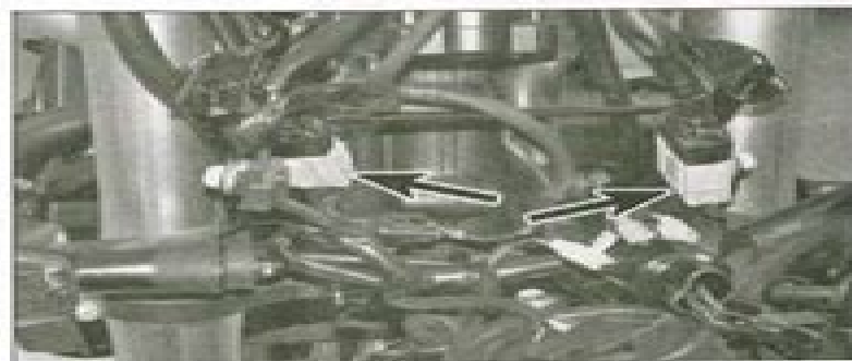
19.2b Handlebar switch wiring connectors (arrowed) - late CB