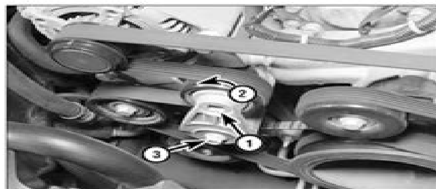
12.6a V6 engine accessory drivebelt tensioner details

8 Remove the accessory drivebelt (see Steps 5 and 6).