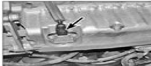
14.4 Disconnect the wiring connector from the oil level/temperature sender