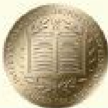
Chair of the Board of Trustees