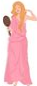
APHRODITE | VENUS