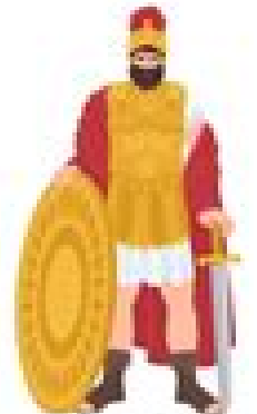
ARES | MARS