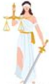
THEMIS | JUSTICE