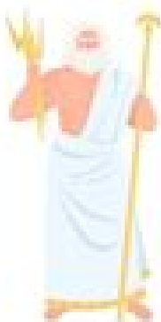
ZEUS | JUPITER