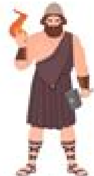
HEPHAESTUS | VULCAN