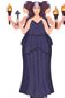
HEKATE | TRIVIA