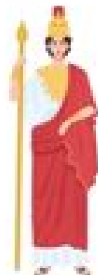
ATHENA | MINERVA