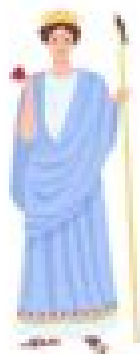
CERES | JUNO