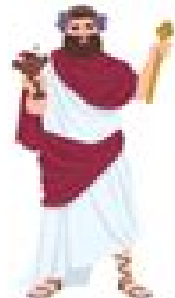
DIONYSUS | BACCHUS