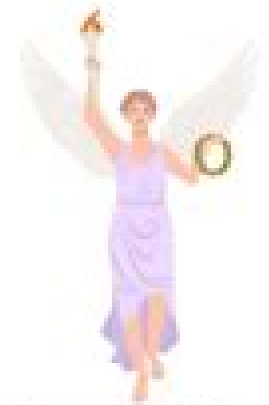
NIKE | VICTORIA