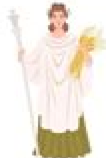
DEMETER | CERES