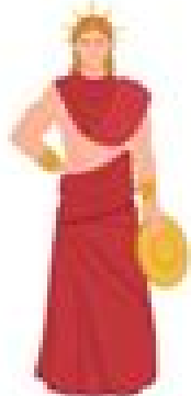
HELIOS | SOL