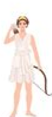
ARTEMIS | DIANA