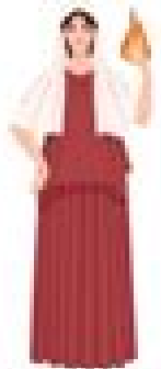
HESTIA | VESTA