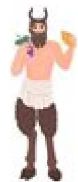
PAN | PANURGUS