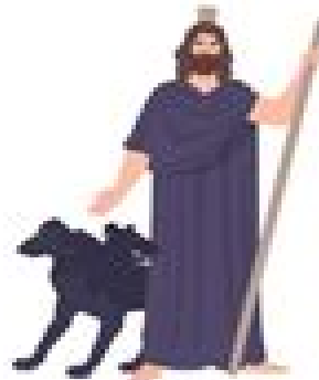
HADES | PLUTO