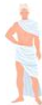
APOLLO | PHOEBUS