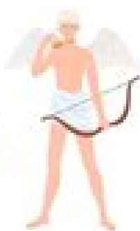
EROS | CUPID