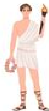
HYAMHAOS | HYMEN