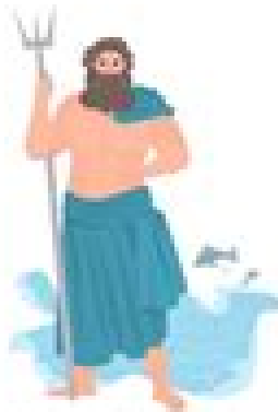
POSEIDON | NEPTUNE