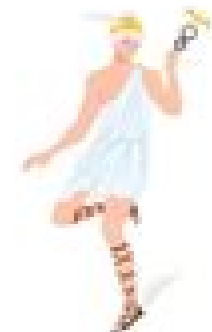
HERMES | MERCURY