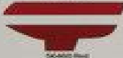
50000 Red A B C D E F G H