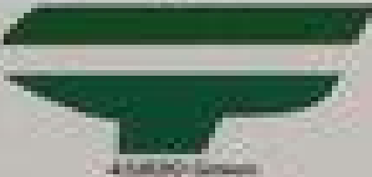
40000 Green B C