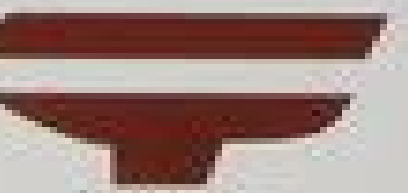
50000 Red Brown I