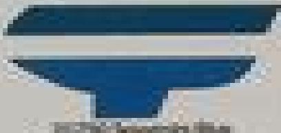
20200 Jewelrite Blue