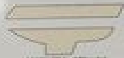
20400 White (Standard)