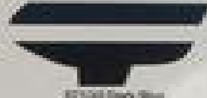
20500 Dark Blue