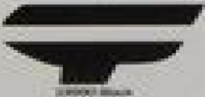
20000 Black A B C D E F G H I