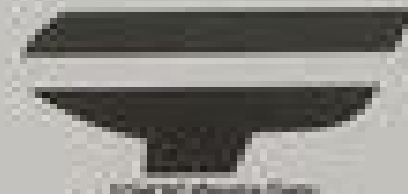
20400 Marine Grey