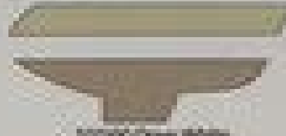
20000 Ocean White