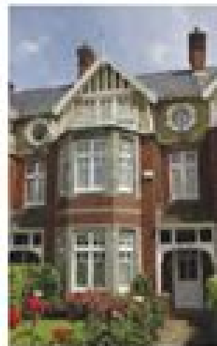
1.29 During the Victorian period, there was a new for contrasting materials such as polished granite and stone used window patterns, in part derived from the 18th and 19th centuries.

houses becoming commonplace. These were built in a style that gradually replaced the other, handmade brick that had been used throughout the 18th and first part of the 19th century. This allowed houses and commercial buildings to be designed with greater elegance, often with decorative moulded decorative work around entrance porches, windows, cornices and chimneys.