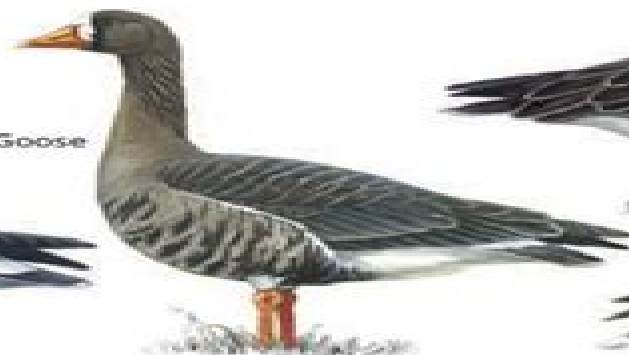
Greenland form (spp. flavirostris)