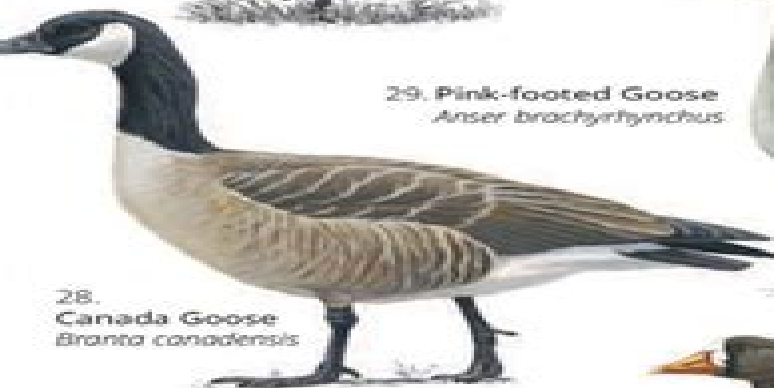
28. Canada Goose Branta canadensis