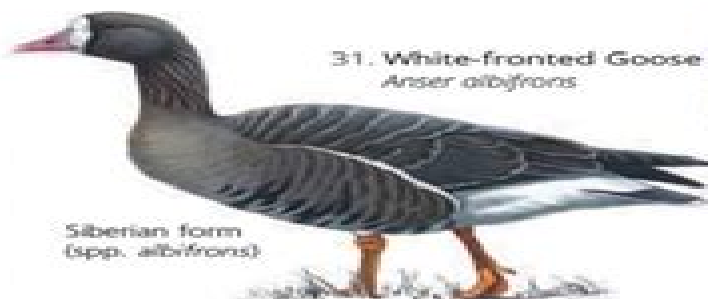
Siberian form (spp. albifrons)