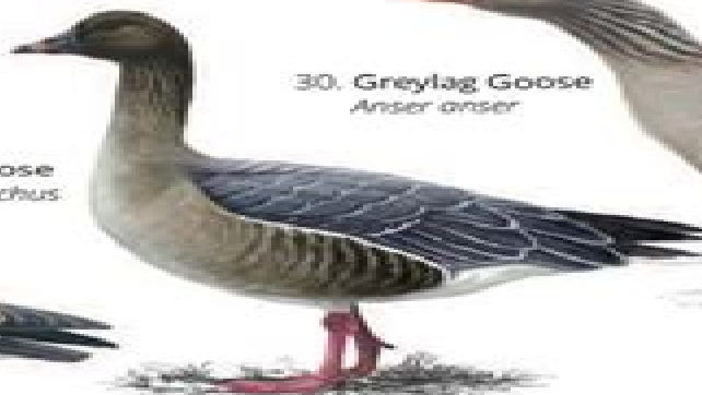
30. Greylag Goose Anser anser