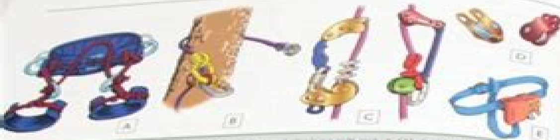
Figure 16.2 Various climbing equipment and devices. (A) Climbing harness, (B) Mechanical friction device, (C) Micropulley, and (D) Knot. A variety of other equipment is also used.