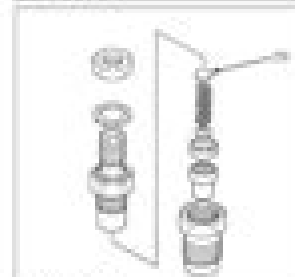
(3) Adjusting Washer