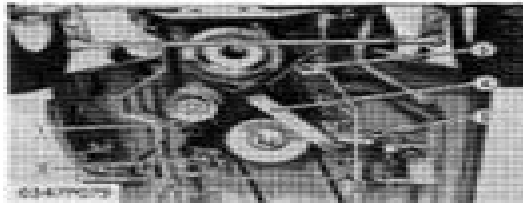
63477002 (1) Spring (4) Tension Pulley (2) Speed Change Rod (5) Clutch Rod (3) Tension Spring