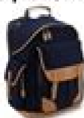
L.L. Bean Sportsman's Rucksack. $119.