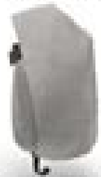
Cote et Ciel Isar Rucksack. $220.