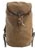
Frost River Summit Pack. $120.