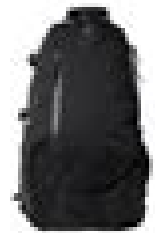
Visvim Lamina 20L.