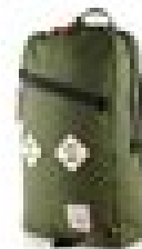
Topo Designs Daypack. $140.