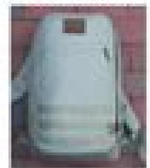
GoRuck GR1. $295.