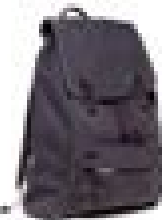
Everlane Snap Backpack. $65.