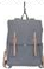
Makr Farm Rucksack. $165.