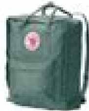
Fjallraven Kanken. $75.