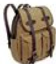
Filson Rucksack. $290.