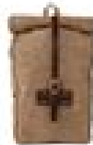
Archival Roll Top. $250.