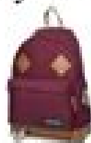
Eastpak Padded Pak'r. $85.