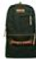
Wheelmen & Co. Scout Series. $162.