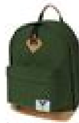
Parrott Canvas Uwharrie. $65.