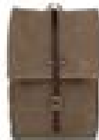
Archival Rucksack. $260.