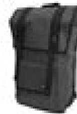
Mission Workshop Fitzroy. $229.