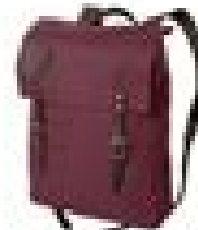
Duluth Pack Scoutmaster. $195.