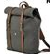
Mismo MS Backpack. $300.