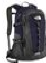
The North Face Hotshot. $99.