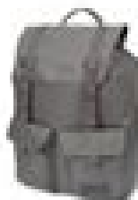
Eastpak Klosser Cottown. $65.