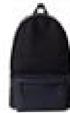
Ilse Daypack. $325.