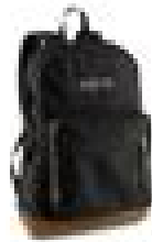
Jansport Right Pack. $55.