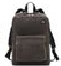
Jack Spade Waxwear Backpack. $365.