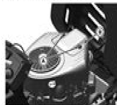
Air cleaner cover (A) and air cleaner element (B)

IMPORTANT: Avoid damage! To prevent engine damage, do not allow any foreign objects to fall into the carburetor air intake.